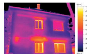
Thermal image with ScaleAssist